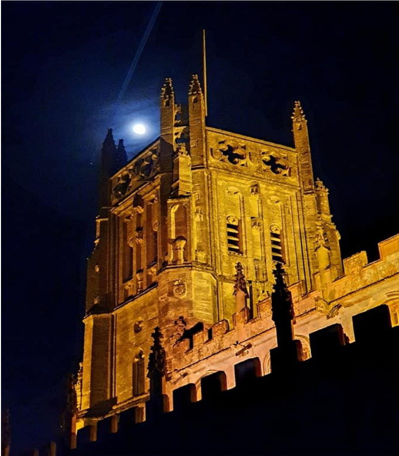
Snow Moon over St.Mary's last Saturday

(First edition published on 22nd March 2020 – the start of Lockdown – it was only three sheets - and in case you start counting I was on holiday for one week!)